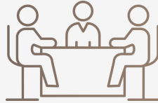
Mentoring by PSA Leaders